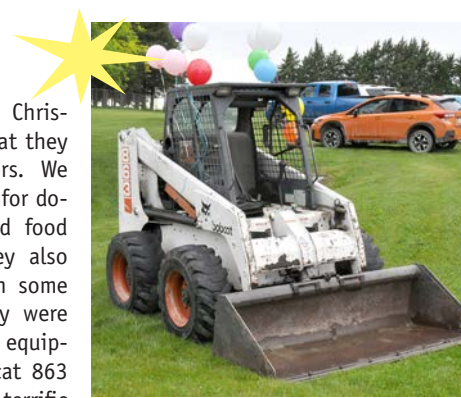
This Bobcat 863 skid steer is being purchased by CGS at a bargain price.

This spring, Nebraska Christian College announced that they would be closing their doors. We are grateful to the college for donating paper products and food items to our camp. They also offered us great prices on some of the campus items they were selling: furniture, tools, equipment and their used Bobcat 863 skid steer. They gave us a terrific price on the Bobcat, but we are still raising money to pay for it ($6,500). This fantastic piece of equipment is in use nearly every day at camp. If you would be interested in helping us with the purchase of the Bobcat 863, we'd appreciate your designated gift toward this purchase. We have made the Bobcat 863 purchase our CGS Summer Giving Project for 2020. [The timing is perfect for us to have this machine.] If you choose to make a gift to help us buy the Bobcat 863 Skid Steer, please indicate that when you make your gift to Camp of the Good Shepherd or FGCI.