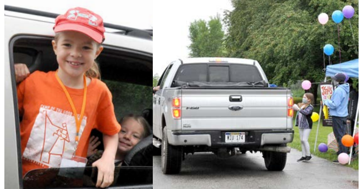
Our first Camp of the Good Shepherd Drive-Thru Rally@theCamp! was a lot of fun for all. Watch for details about our next camp rally.