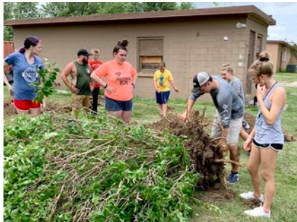
Sheep Dog teenage helpers transplant a bush.

Over the past several months we have been able to put energy and time into many important outdoor projects at our Camp of the Good Shepherd which would have been impossible to do during a normal spring and summer of camp. Some of these projects have been waiting for years to be completed.