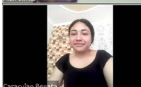
Roma kids sponsored by FGCI take an online English course.